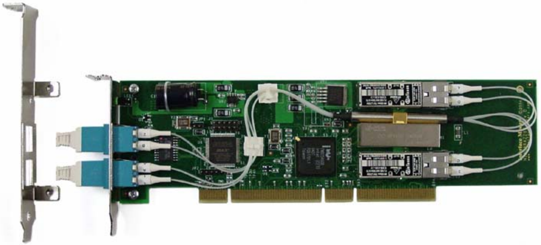
Figure 2 Niagara 2280